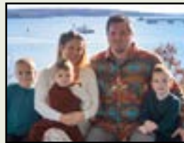
Building Community PAGE 3