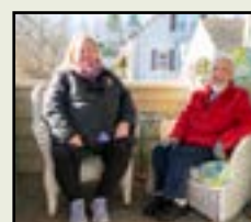
Neighbors in Need this Winter PAGE 4